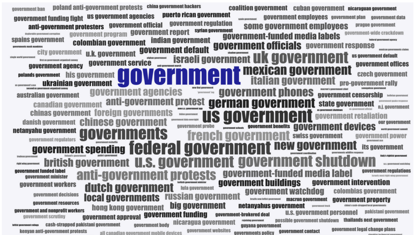
A view of the information space related to the topic of the week, based on headline frequency.

Government spending defined: Government spending encompasses the total expenditures a government makes within a fiscal year, covering areas like public servant salaries, defense, health, education, and others. It can be broadly categorized into recurrent spending for regular costs, capital spending on future-beneficial assets like infrastructure, and various transfers and subsidies, which include payments without a direct return, such as pensions and business support. Additionally, interest payments are made on any outstanding governmental debt.