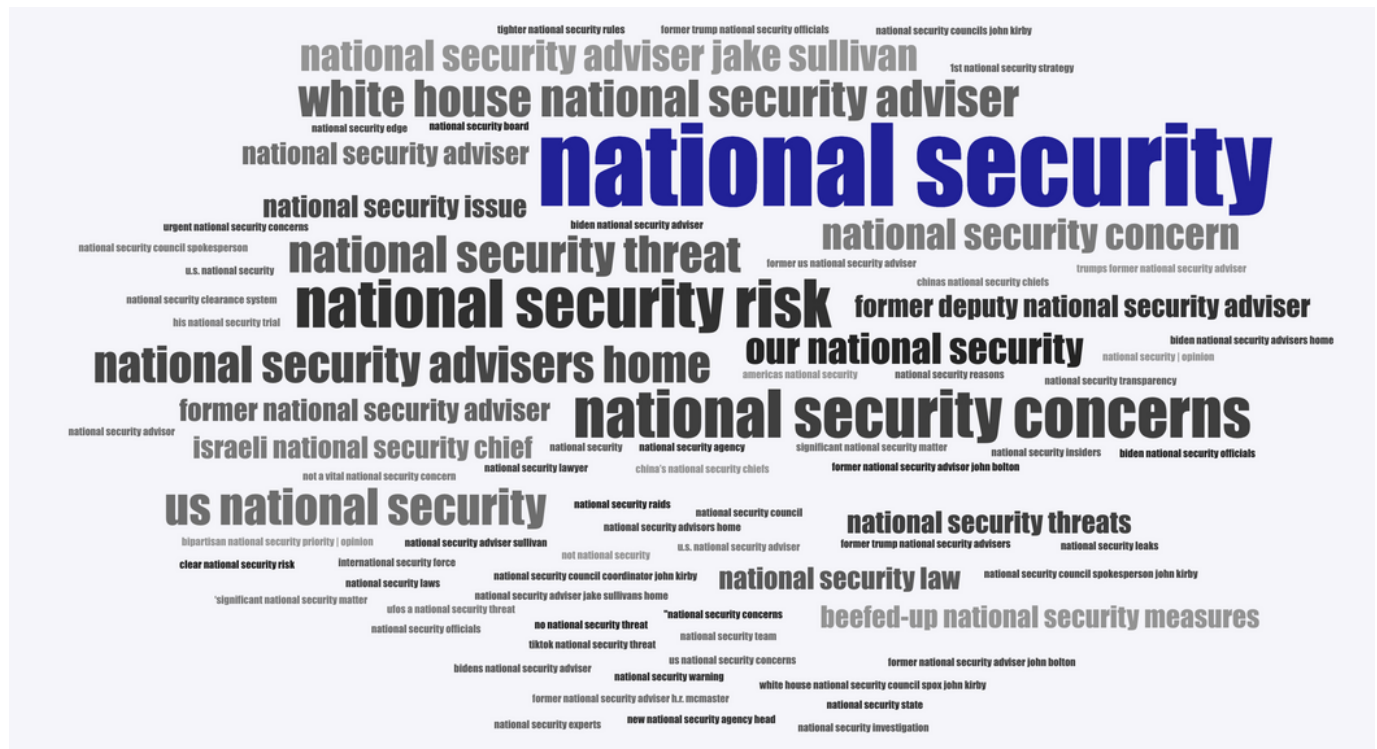
A view of the information space related to the topic of the week, based on headline frequency.

National Security defined: National security is a wide-reaching topic, but can be distilled down to the measures taken to protect a nation's citizens, sovereignty, territories, and economic stability from both internal as well as external threats. The domains of particular importance to national security include (but are not limited to) military/defense, border control, economic security, and cyber protection, while also expanding into the energy and environmental domains given the connection they can have with potential disasters and health crises. National security involves a coordinated effort from various government sectors(e.g. Executive, Legislative) to identify threats, develop counter measures, and ultimately implement its strategies.