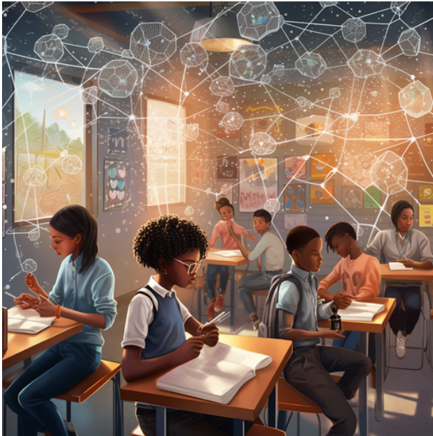
AI Generated Image

"Generative chat is a double-edged sword, akin to a powerful tool that can illuminate the path of knowledge with its insights, but must be wielded with caution to avoid the shadows of misinformation and bias."