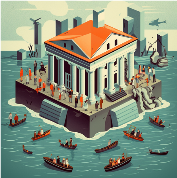
AI Generated Image

"Risk management for financial institutions is like building a solid foundation amidst a changing landscape. It's the art of balancing opportunity and prudence, empowering institutions to confidently navigate uncertainties while safeguarding their core objectives and stakeholder trust."