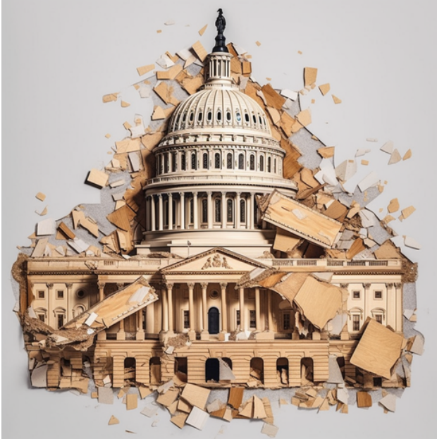
AI Generated Image

"Political transitions are not merely symbolic events, but rather complex processes that play a critical role in shaping the direction and effectiveness of governance in the United States."