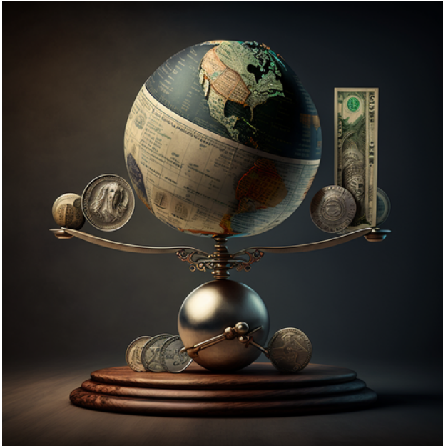
AI Generated Image

"The economy is a complex and interconnected system, where shifts in economic indicators such as interest rates, labor market conditions, housing prices, and GDP growth can create a ripple effect impacting both the public and private sectors, as well as large and small organizations; staying informed and adaptable to economic changes can provide valuable insights into navigating the changing economic landscape."